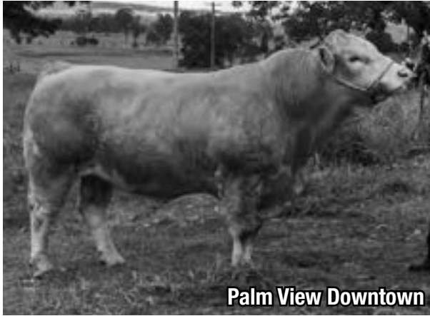
Palm View Downtown

Dam is Palm View Fantasy → Smokin, who won Supreme Exhibit at the Casino Beef Week and North Coast National in past years.